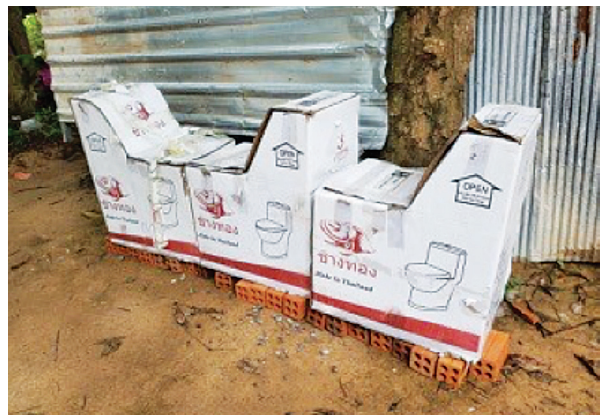
An important feature is the new washroom, of course with toilets