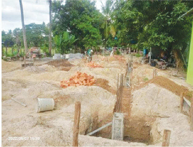
The foundation was dug, and concrete set