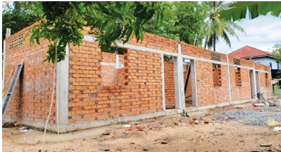
The now the walls are set and it is almost ready for the roof, then windows and doors

RESTORING HEALTH, HOPE AND DIGNITY IN JESUS' NAME